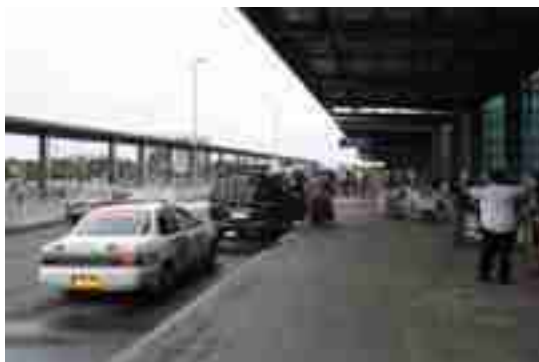
NAIA Terminal 3 view