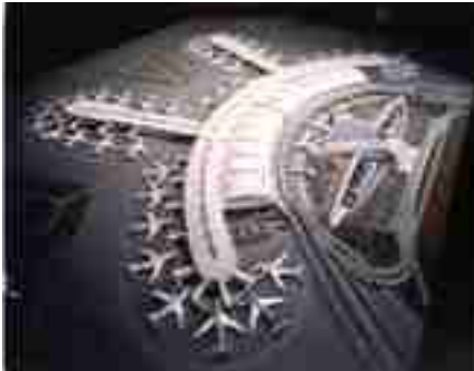
NAIA Terminal 3 View