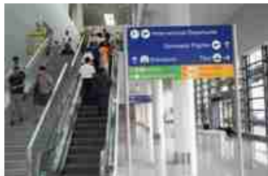
NAIA Terminal 3 view (Moving to Domestic)