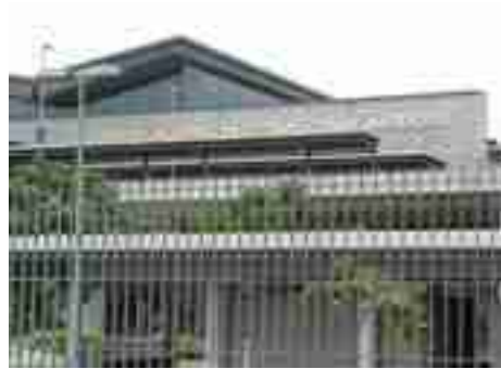
NAIA Terminal 3 View

Immigration procedures : Immigration > Find Bags > Customs > Move Domestic Terminal (2nd floor) > Domestic ticket